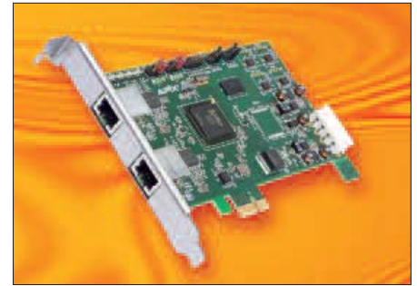
Figure 3: congatec PCI Express APIX expansion card

positive and negative current of the differential signal negate as optimally as possible. The better the continuous cable impedance of 100 ohm, and the more even the twisting, the greater the maximum possible cable distance. In order to fulfil the EMI requirements, it is recommended to use shielded twisted pair cables, which are slightly thicker and somewhat less flexible than unshielded cables. The standard Ethernet cable CAT5, which is available in shielded or unshielded versions, offers four differential pairs of wires, enabling the transmission of APIX downstream and upstream. The remaining two pairs are available for any signalling, such as power supply, or another data bus, which offers high flexibility for different scenarios. CAT5 cables are available from many vendors at relatively low cost and