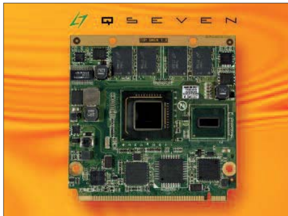
Figure 1. conga-QA – an easily integrated, small size PC module based on the Intel Atom processor

Remote touchscreens and control displays typically require a bunch of cables for video, power and control data. APIX concentrates all signal and power lanes in a single standard Ethernet cable to increase implementation flexibility and to decrease overall system cost.